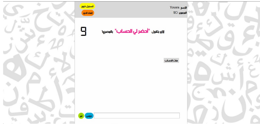
Fig. 1: The player's perspective after providing one guess

We developed a Game With A Purpose that provides players with phrases in MSA, and asks them to guess corresponding ones in the Egyptian dialect (see Figure 1). The more frequent a guess is matched, the higher the score the player gets.